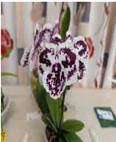
A nice wide-lipped Phalaenopsis Charming Dalmation benched by Jerod Pritchard