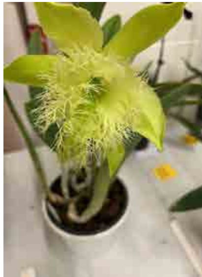
An impressive Rhyncholaelia digbyana benched by Paige Sinclair (the national flower of Honduras)