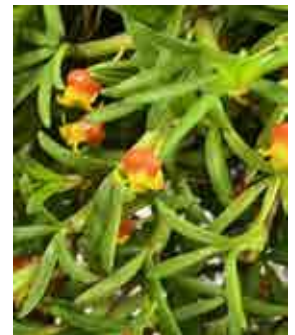
A well grown and spectacular Medicalcar decoratum from New Guinea. Grown to perfection by Rhonda Smith