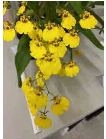
Rhonda Smith's Oncidium Sweet Sugar . Always performs well.