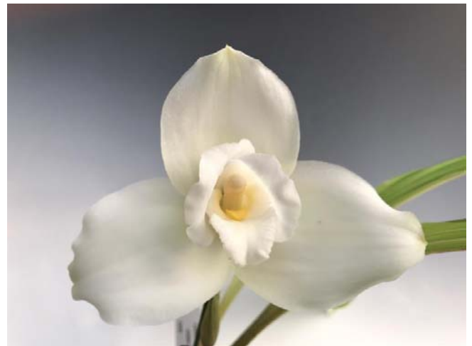
Lycaste Shonan Beat

As the September meeting is always just before our Spring Show, we often see a decline in the number of plants that are benched on the meeting night. We encourage all members to bring as many plants as possible so we have a good display at this meeting.