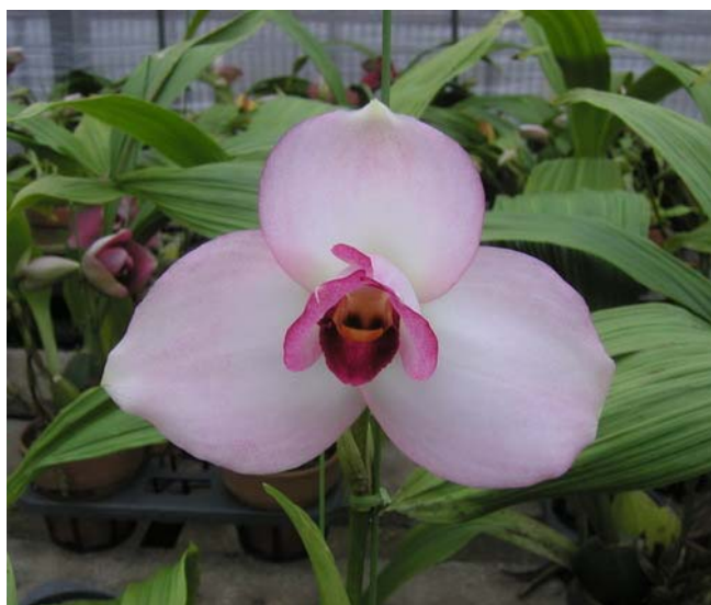
Lycaste Sunray "Red Eye"

We welcome as many sales plants as possible. Please bring in on Friday afternoon or early Saturday morning. Sales tags will be available on the day or you can collect some at the monthly meeting on Thursday, 7 th September.