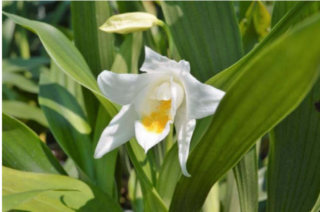
Coelogyne mooreana "Brockhurst" FCC which flowered in January.