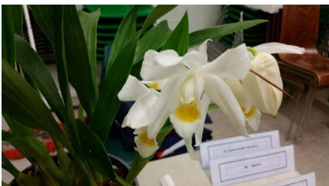
Coelogyne mooreana "Brockhurst"

We will produce a growing guide for distribution at a future meeting.