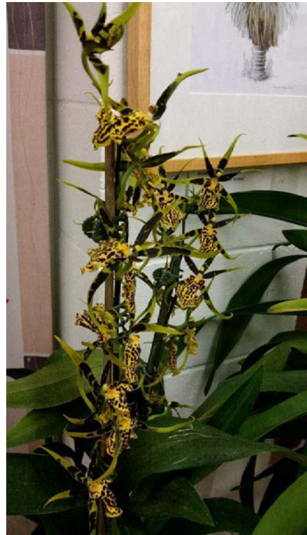
Hybrid orchid from Oncidium group on display table at our February meeting