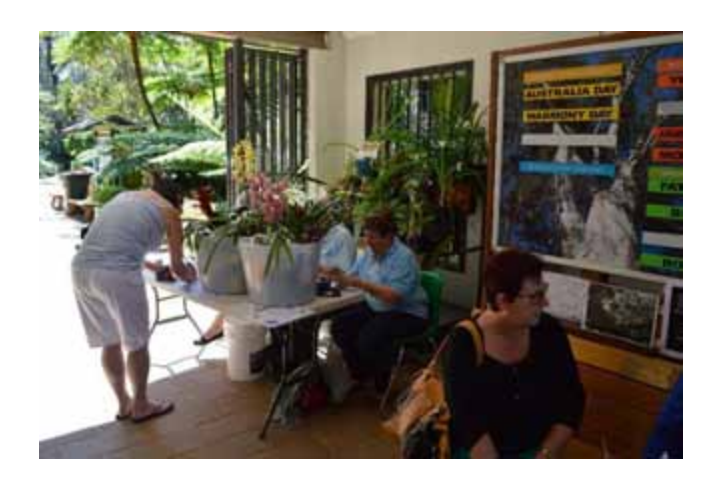
Selling raffle tickets at the show.

There are other jobs that people do that are not elected positions but are done by people who are interested in doing the job, such as publicity or library. Please let Ron or one of the committee know if you are interested.