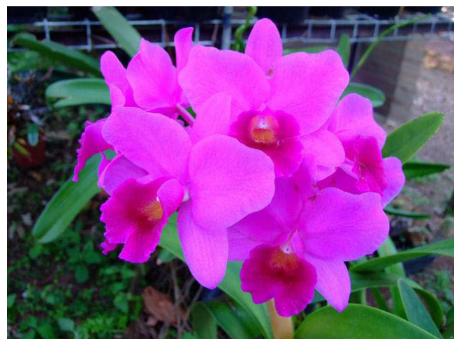
Laeliocattleya Little Susie

Bulbophyllum is one of the largest genera in the orchid family Orchidaceae. With more than 2,000 species, it is also one of the largest genera of flowering plants, exceeded only by Astragalus. This genus is abbreviated in the trade journals as Bulb