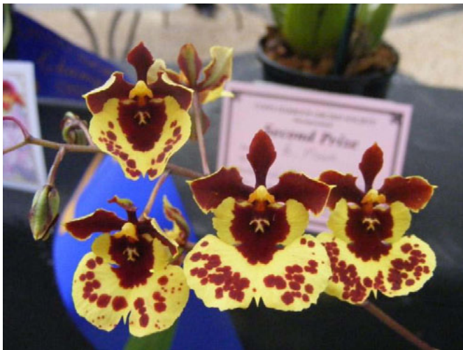
A lovely Equitant Oncidium, now named Tolumnia