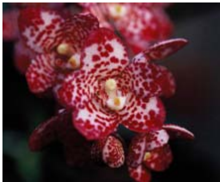
Sarc. Jeanne "Little gem", one of the spotted hybrids.