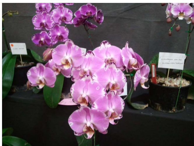
One of the many lovely Phalaenopses on display